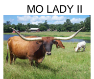
MO LADY II