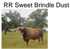
RR Sweet Brindle Dust