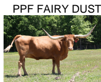
PPF FAIRY DUST