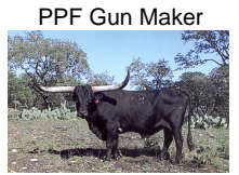
PPF Gun Maker