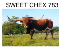
SWEET CHEX 783