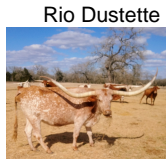
Rio Dustette II